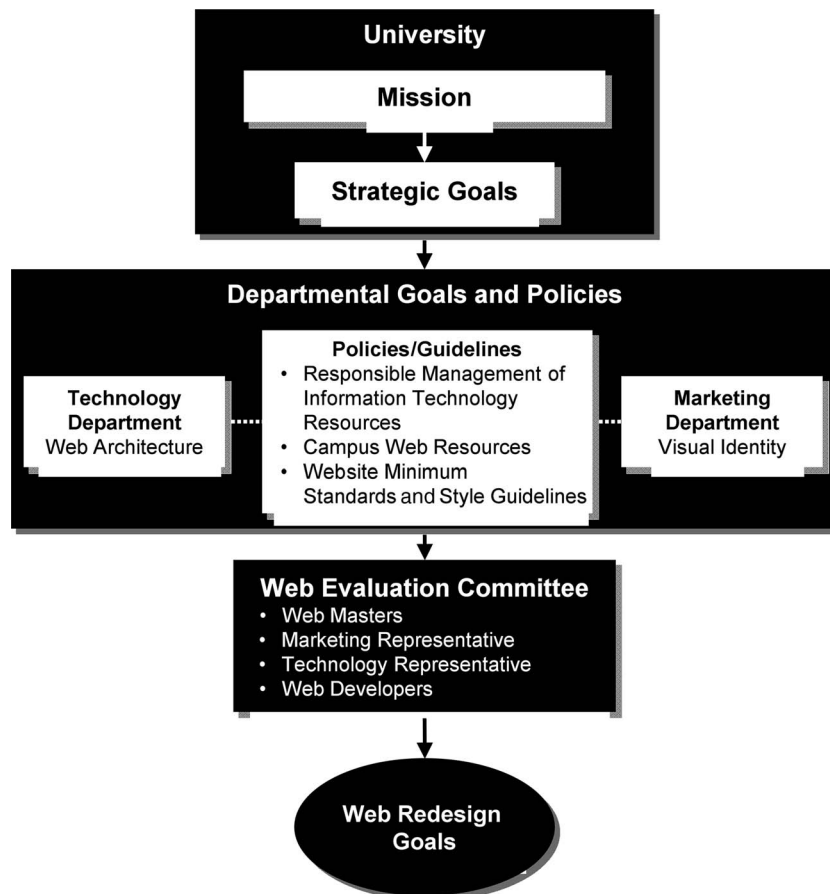
FIGURE 1. RELATIONSHIPS OF THE DEPARTMENTS AND COMMITTEES

Web presence is essential for communicating an intangible educational experience by something that visually represents what the university is about and the unique